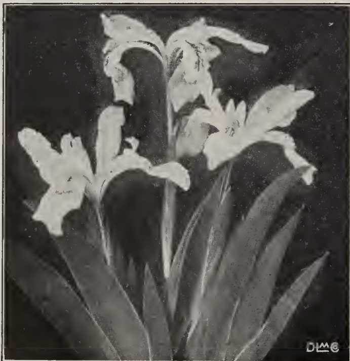
IRIS PUMILA CRISTATA

No less than 5 at the 10 rate, 25 at the 100 rate. Minimum order $2.00